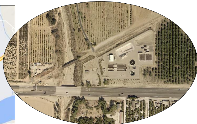
Figure 3: Location of Piru Wastewater Treatment Plant

The collection system includes 10.3 miles of pipeline, ranging in diameter from 6-inch collection lines to 18-inch trunk lines, and one lift station on Center Street. Precise design capacity and peak capacity of the collection system is unknown; a flow study would be necessary to document system capacity. Current flows generated through the District's 667 service connections average 0.2 MGD, well within the facility's permitted capacity of the treatment