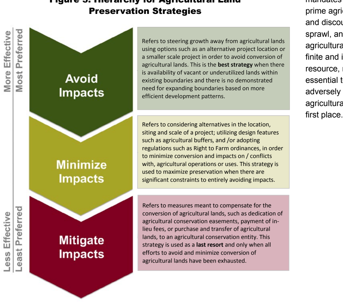
Figure 3. Hierarchy for Agricultural Land

Mitigation consists of measurable preservation outcomes, resulting from actions applied to geographic areas typically not impacted by the proposed project, that compensate for a project's significant adverse impacts to agricultural lands that cannot be avoided and/or minimized.